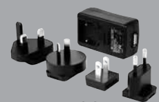
FR08 * 5V SELV USB Power Supply*