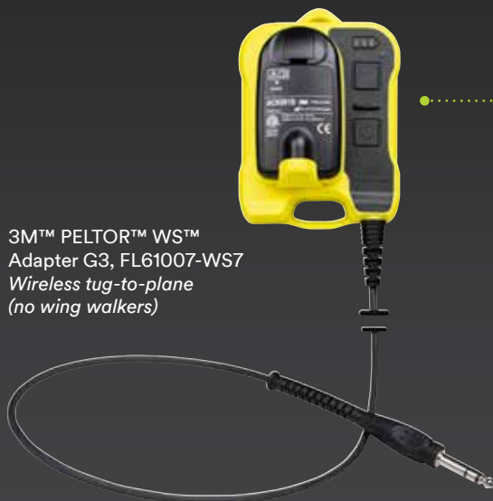
3M™ PELTOR™ WS™ Adapter G3, FL61007-WS7 Wireless tug-to-plane (no wing walkers)

Introducing the 3M™ PELTOR™ WS™ Adapter G3, Ground Mechanic - the ultimate solution for ramp communication during aircraft pushback operations. With our Bluetooth® technology expertise, we bring you a safe and reliable wireless connection that revolutionises ground crew communication.