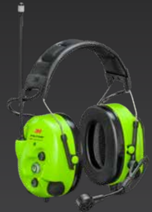
3M™ PELTOR™ WS™ LiteCom Pro III Headset, MT73H7A4D10 Wireless tug-to-plane (with wing walkers)