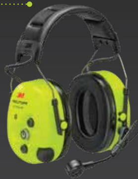
3M™ PELTOR™ WS™ ProTac XPI Communication Headset, MT15H7AWS6 Wireless tug-to-plane (no wing walkers)