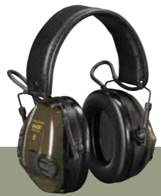
With the three buttons on the right cup you can easily adjust volume and change settings of different modes. A "ghost voice" guides you through the menu and confirms your setting.

equalizer function makes it possible to cancel out certain frequencies to help better hear exactly what you want. You can also adjust the stereo balance to adapt if you for example have a hearing impairment in one ear.