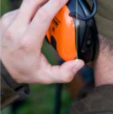
Bluetooth™ enables instant and discreet communication. With the well placed PTT/answer button on the left cup you can easily communicate over the communication radio or take/reject your calls from your cell phone.

A clear and reliable communication between fellow hunters and Game keepers is an outstanding way to boost safety and ensure that for example the number of tags is not exceeded. Peltor™ WS SportTac™ can easily be connected to various types of communication radios via a wide range of specifically designed accessories. The built in Bluetooth™ circuit now also allow for a complete wireless connection with your cell phone or other communication device with Bluetooth™ . Phone can remain silenced in your pocket and only you will hear when you get a call. You can even stream audio in stereo from your phone or MP3 player over the Bluetooth™ link and listen to your favorite music if it gets to boring at your post.