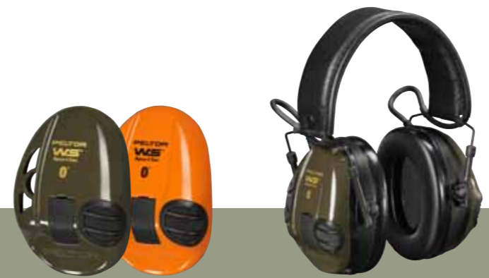
Exchangable shells. The colour differentiation improves safety and makes the wearer easily visible to other hunters.