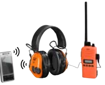
Possibility for dual connections, wireless and wired.